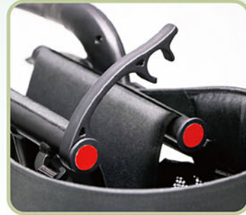
Folding Lock Ring