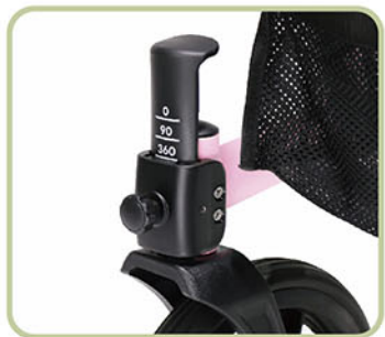
Front Wheel Steering & Positioning (Optional)