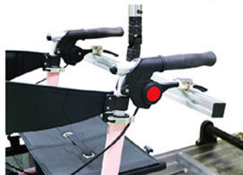
Brake Fatigue Test