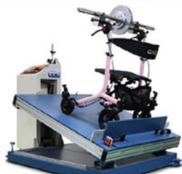
Forward Tilt Stability Test