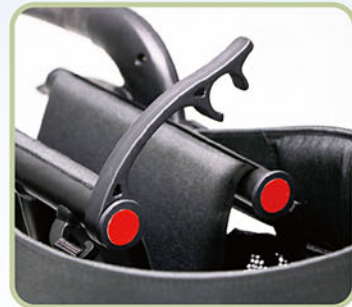
Folding Lock Ring