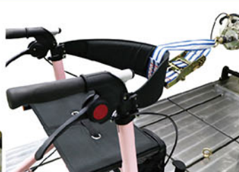
Backrest Static Test