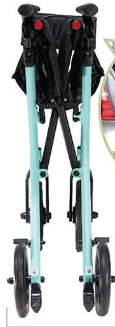
Folding Width: 30cm