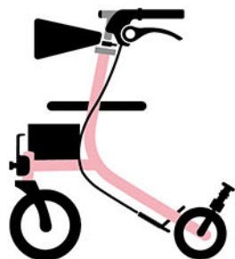
● Sakura Pink