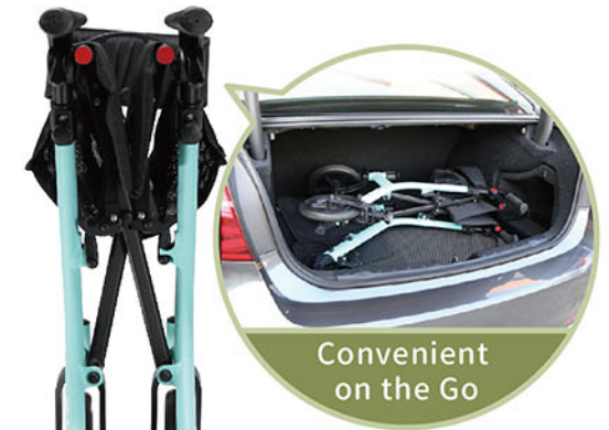
Convenient on the Go