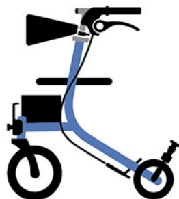
● Tranquil Blue