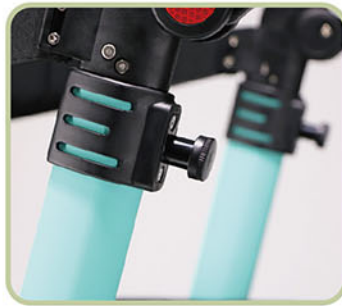
Handle Height Adjustment Rod