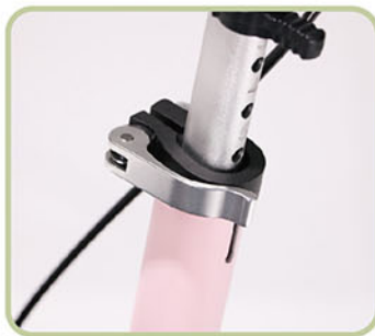
Quick-Release Height Adjustment