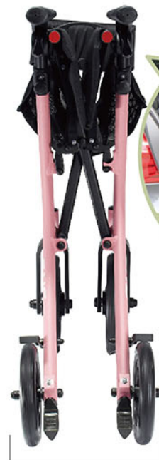
Folding Width: 30cm