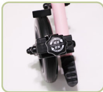
Rear Wheel Deceleration Adjustment (Optional)