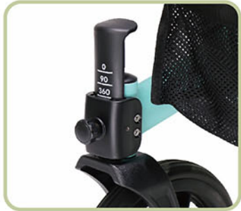
Front Wheel Steering & Positioning (Optional)