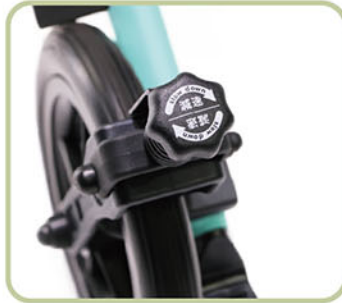
Rear Wheel Deceleration Adjustment (Optional)