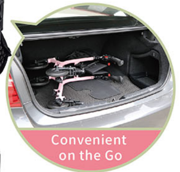
Convenient on the Go