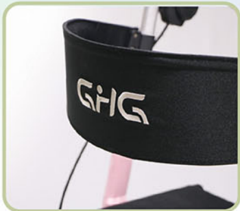
Wide and Adjustable Backrest